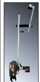
Extension bar (JE200)