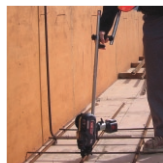
Extension bar (Option)

Both the National Institute for Occupational Safety and Health and Health Construction Safety Association of Ontario state the MAX Re-bar Tying Tool reduces the risk of Carpal Tunnel Syndrome and other work related musculoskeletal disorders.